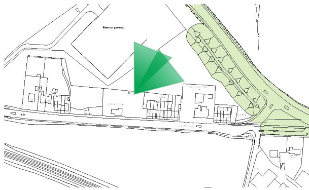
Image location: rear garden overlooking field off Buxton Road, near to covered reservoir

Photomontage images as prepared for Planning Submission, October 2013. This Photomontage has been created by the SEMMMS team using a methodology as stipulated by the Landscape Institute (LI) Advice note '01/11 Landscape Institute - Photography and Photomontage in Landscape and Visual Impact Assessment'. No part of this image may be copied without written permission from the SEMMMS Team.